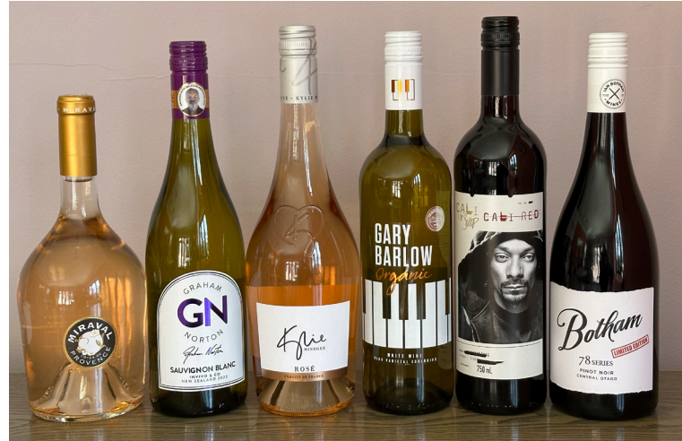
Can you guess which bottle is produced by which celebrity?