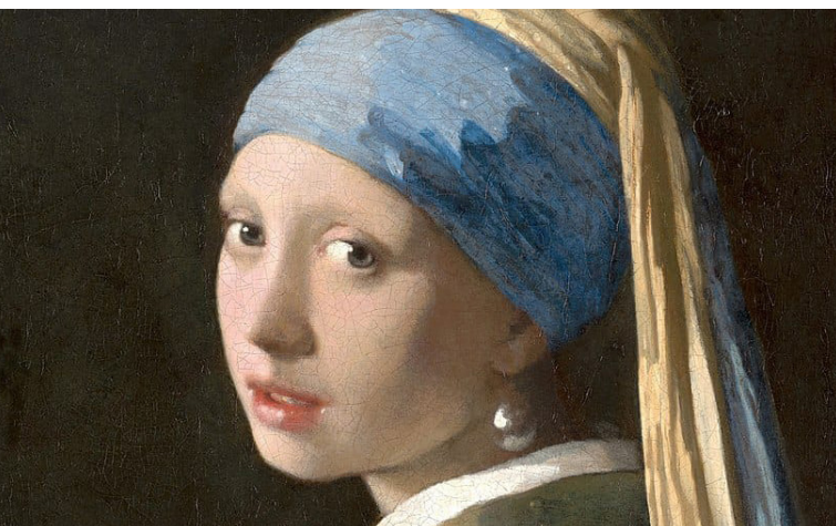
"Girl with a Pearl Earring", Johannes Vermeer, 1665, oil on canvas